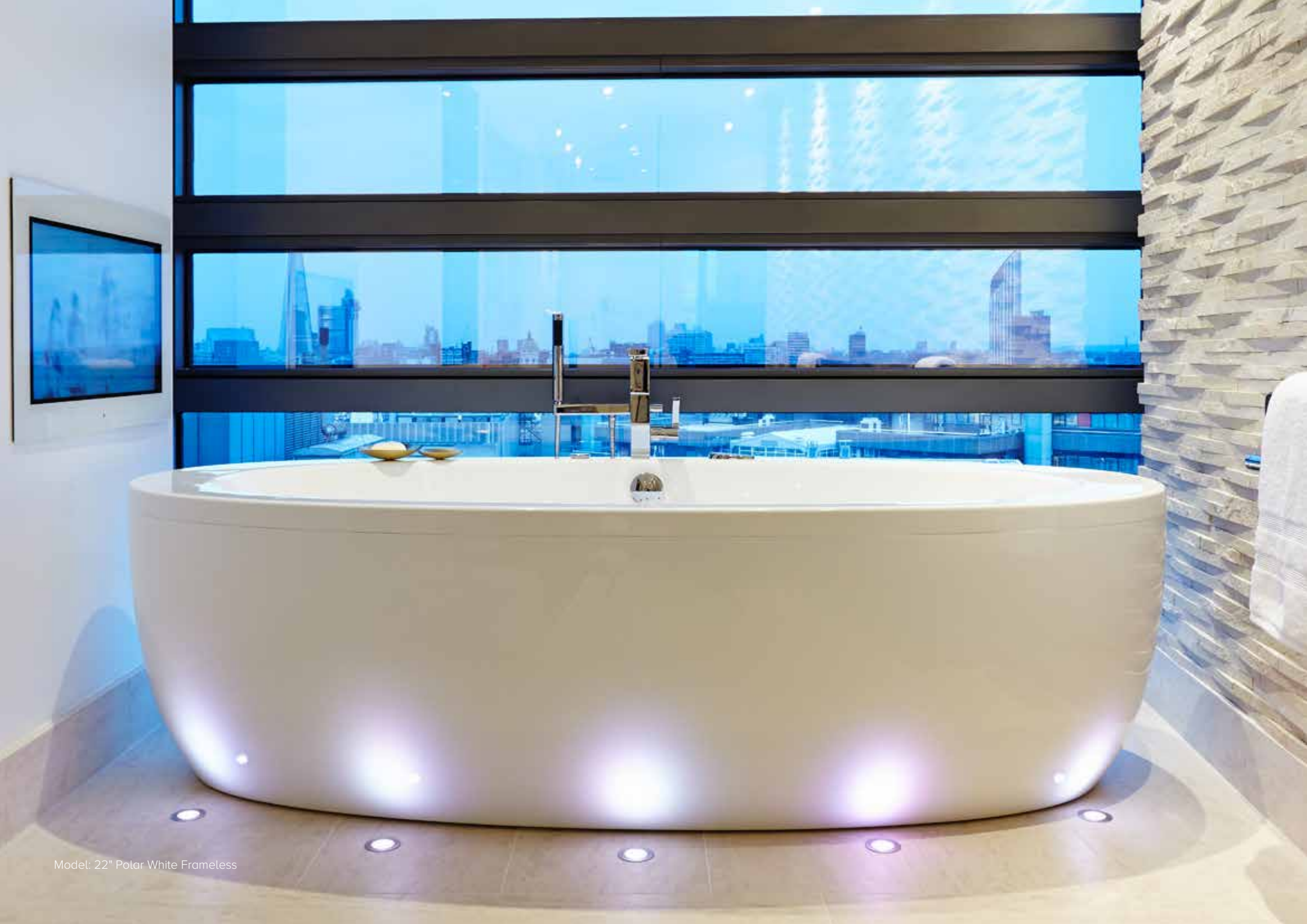
Model: 22" Polar White Frameless