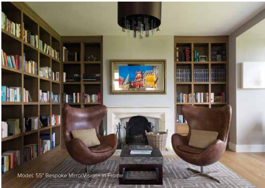
Model: 55" Bespoke MirrorVision+ in Frame

the television image to be clearly seen when the tv is switched on. MirrorVision+ models are perfect for bedrooms, living rooms, studies, bathrooms or anywhere there is a requirement for a discreet, seamless television installation.