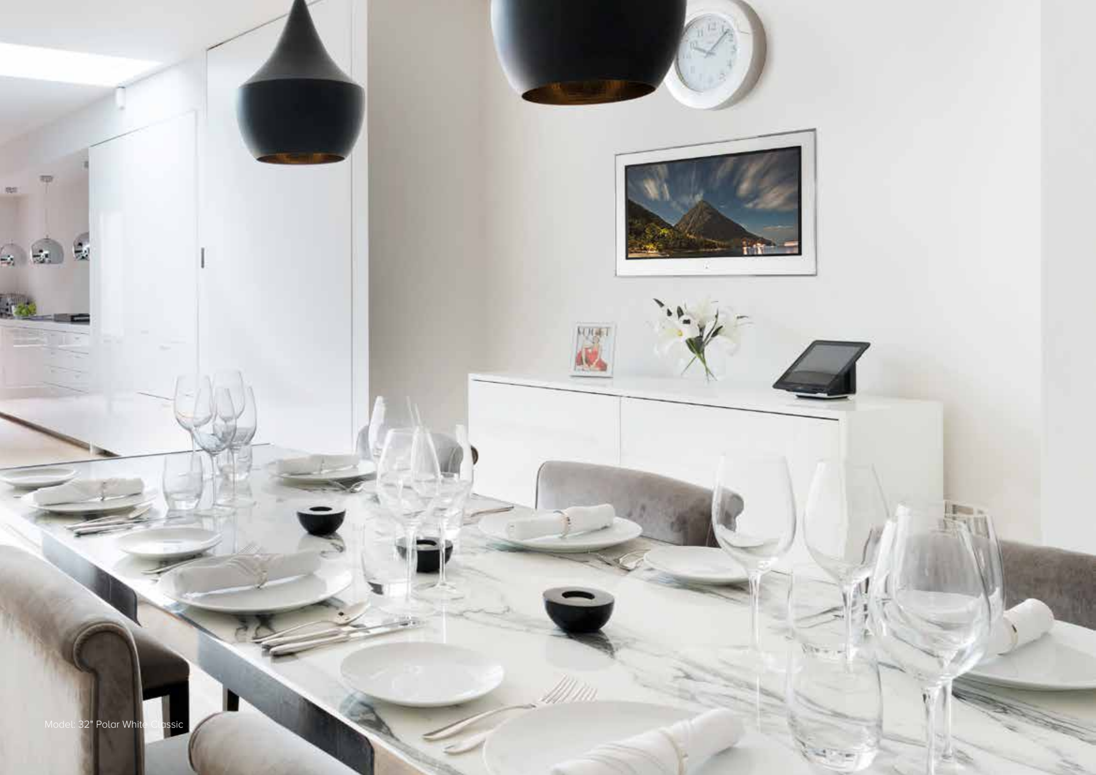
Model: 32" Polar White Classic