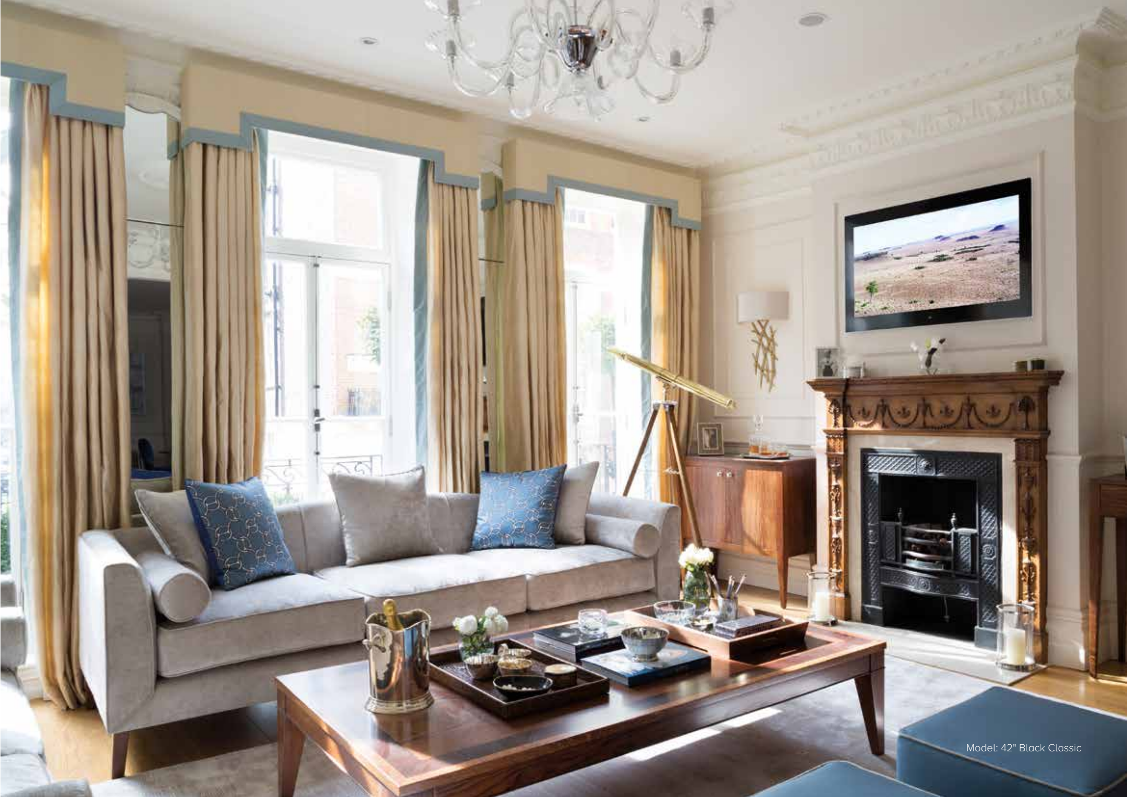
Model: 42" Black Classic