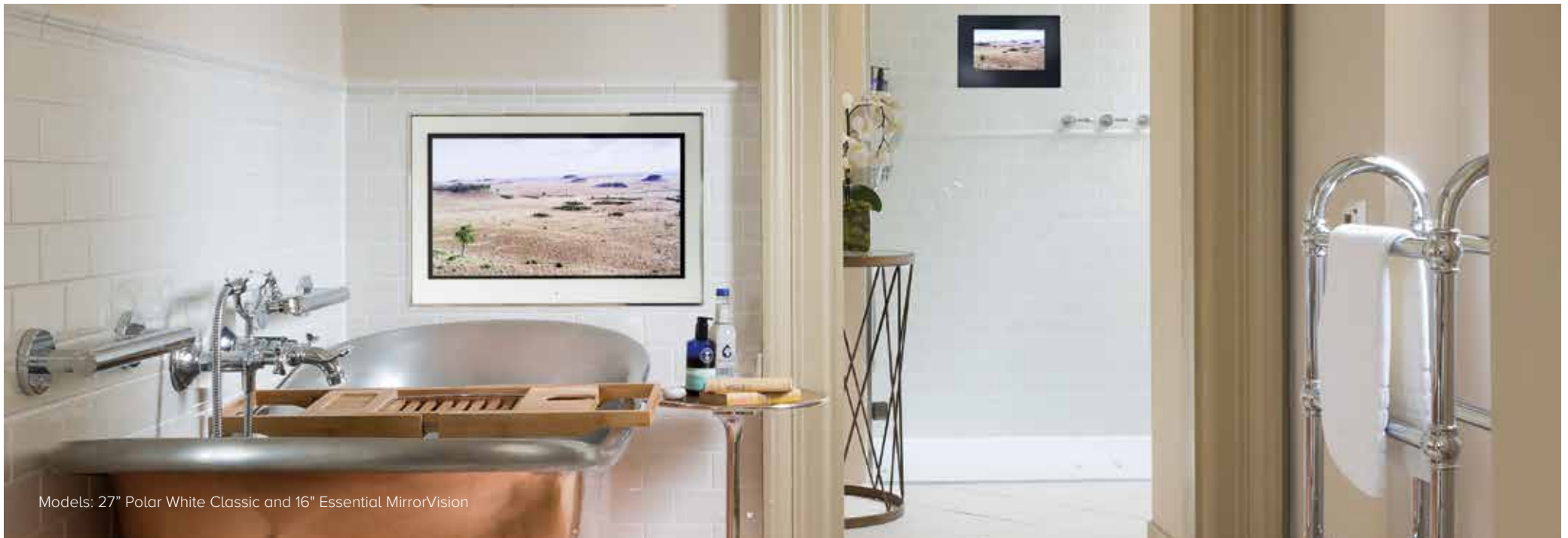
Models: 27" Polar White Classic and 16" Essential MirrorVision

on downloads, listening to favourite tracks or keeping up with current affairs, an Aquavision will transform your bathroom from a functional space to your own personal sanctuary.