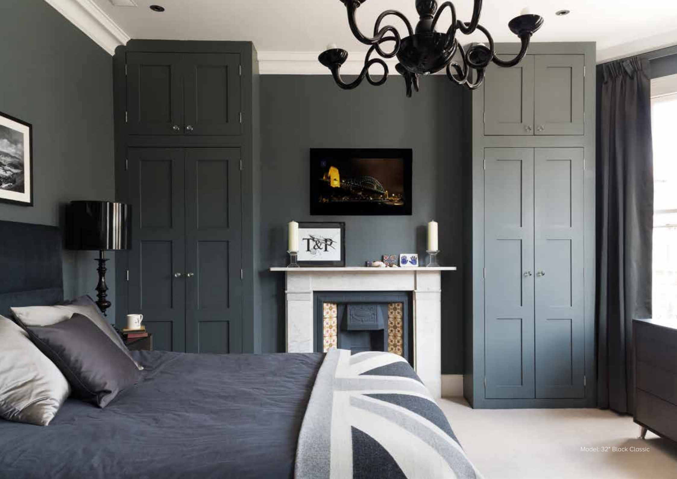
Model: 32" Black Classic