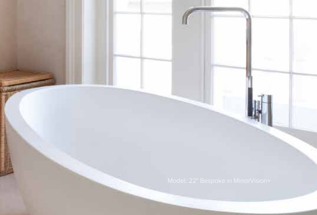
Model: 22" Bespoke in MirrorVision+