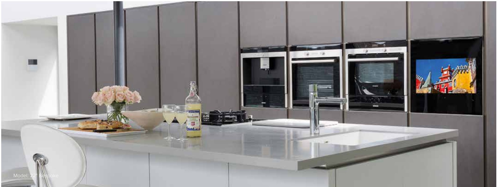
Model: 22" Bespoke

control a Sky box via the Aquavision device. Every element of today's modern kitchen has been cleverly designed to combine luxury with functionality. An Aquavision should be an intrinsic part of the overall design, not an afterthought.